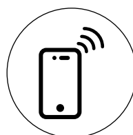
Simple documentation of measured values via smartphone app