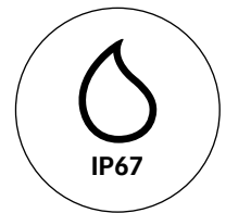
Dustproof and waterproof according to IP67