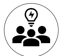
Intuitive operation of the basic device and adapters