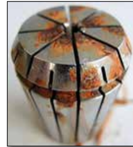
Competitor Stainless Steel ER Collet (Germany) / Material: DIN 1.4034