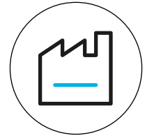
Available from stock