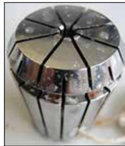
REGO-FIX Stainless Steel ER Collet / Material: DIN 1.4122