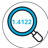
High quality stainless steel