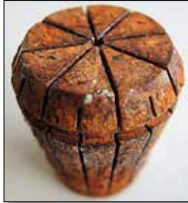
Standard ER Collet / Material: Conventional Spring Steel